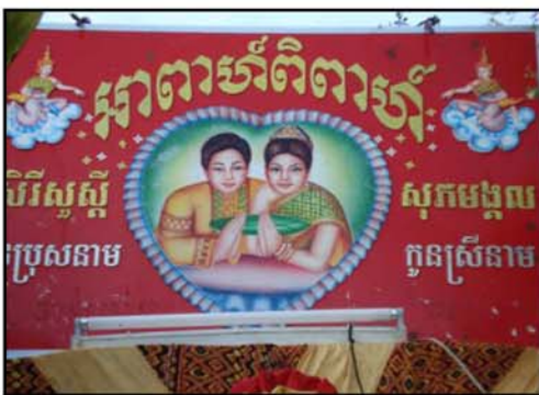
Khmer New Hope Wedding Library of Cambodia American Sponsors December 9, 2006