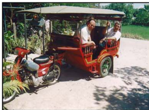
Tuk - Tuk Bookmobile Angseong Library to Phnom Penh December 9, 2006